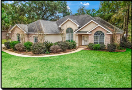
Photo sessions take approximately 2 hours to complete. It's best if owners, tenants, children and pets leave the premises. Alluring Images retains rights to the media products and they may not be altered or shared without expressed permission.